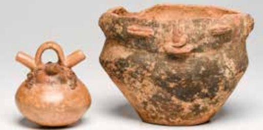
715. Tairona Anthropomorphic Vessel & Calima Toad Vessel (2) Colombia. Ca. 500-1000 A.D. 5-3/8"H. & 4"H. Private collection of a NJ physician, acquired from Vito Giallo Antiques, NYC., acquired 1980s-1990s. Est. $300-$500 Closing: Wednesday, March 4th, 4:30 P.M.