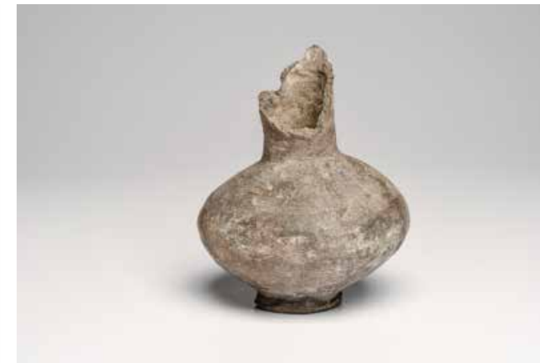
727. Native American Grayware Vessel Southwest, USA. Ca. 1000-1450 A.D. 7-1/2"H. x 6-1/4"D. Private NYC collection, acquired by the current collection prior to 1997. Est. $100-$200 Closing: Wednesday, March 4th, 4:54 P.M.