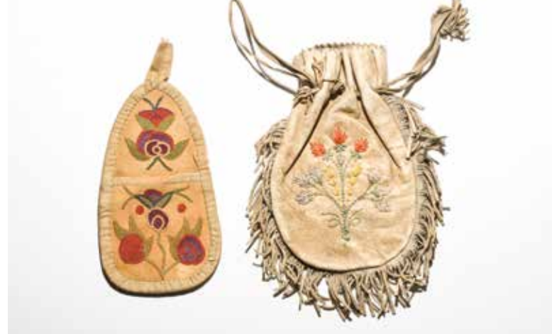
725. Native American Embroidered Pouches (2) Huron. Northeast USA. Ca. 19th century to early 20th century. 8"L. (inc. tassels) & 7-1/2"L. Collection of Judy and Harmer Johnson. Purchased from J. Economos, 5/29/1976, inv. # 1186. Est. $400-$600 Closing: Wednesday, March 4th, 4:50 P.M.