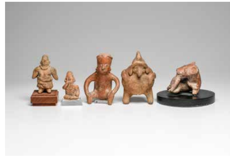
702. Colima Figures & Animals (5) Colima, Mexico. Ca. 100 B.C. - 250 A.D. 2-3/4" to 5-3/8"H. Sold for the benefit of The Everson Museum of Art, Syracuse, NY; gift of Philip Holstein, 1980s. Est. $500-$800 Closing: Wednesday, March 4th, 4:04 P.M.