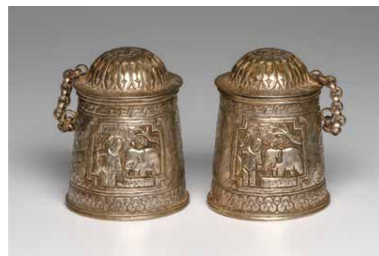
728. Chinese Small Silver Lidded Tea Cups (2) China. Ca. late 19th to early 20th century. 3-3/8"H. x 2-1/2"W. Private Pennsylvania collection, acquired mid 1980s. Est. $500-$800 Closing: Wednesday, March 4th, 4:56 P.M.