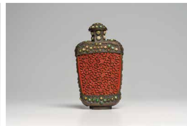
729. Chinese Large Snuff Flask China. Ca. 1900-1920. 6-1/2"H. x 4"W. Private NYC collection, acquired by the current collection prior to 1997. Est. $300-$500 Closing: Wednesday, March 4th, 4:58 P.M.