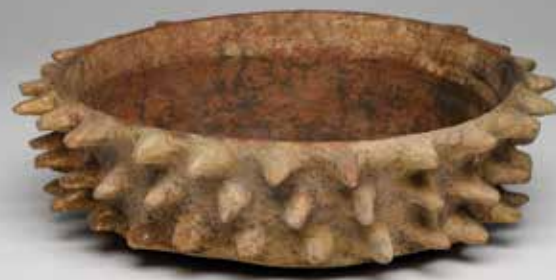
709. Maya Spiked Bowl Maya regions. Ca. 500-800 A.D. 11-1/2"D. x 3-5/8"H. Private FL. physicians collection, acquired 1970s-1990s. Est. $400-$600 Closing: Wednesday, March 4th, 4:18 P.M.