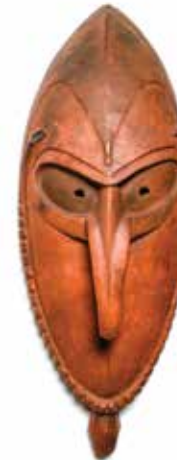
730. Ramu River Mask Papua New Guinea. 21"H. (53.3cm) Private NYC collection; the mask acquired from Tepper Gallery, NYC., 1970s. Est. $1,800-$2,500 Closing: Wednesday, March 4th, 5:00 P.M.