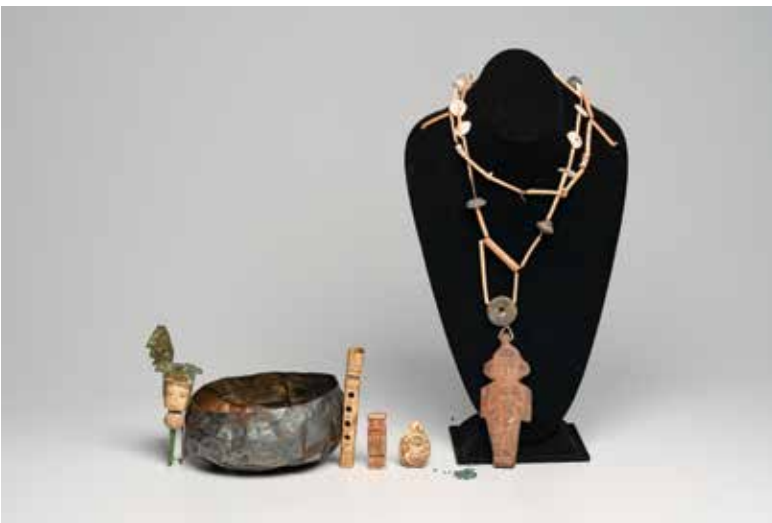
720. Chancay Silver Bowl & Miscellaneous Lot (6+) Bowl found in the Haucho area, near Chancay. Ca. 800-1250 A.D. 6-1/2"D. x 3"H. (bowl) and 45"L. (necklace, inc. charm) Ex. Daley collection, NY., acquired 1960s-1970s. Est. $1,000-$1,500 Closing: Wednesday, March 4th, 4:40 P.M.