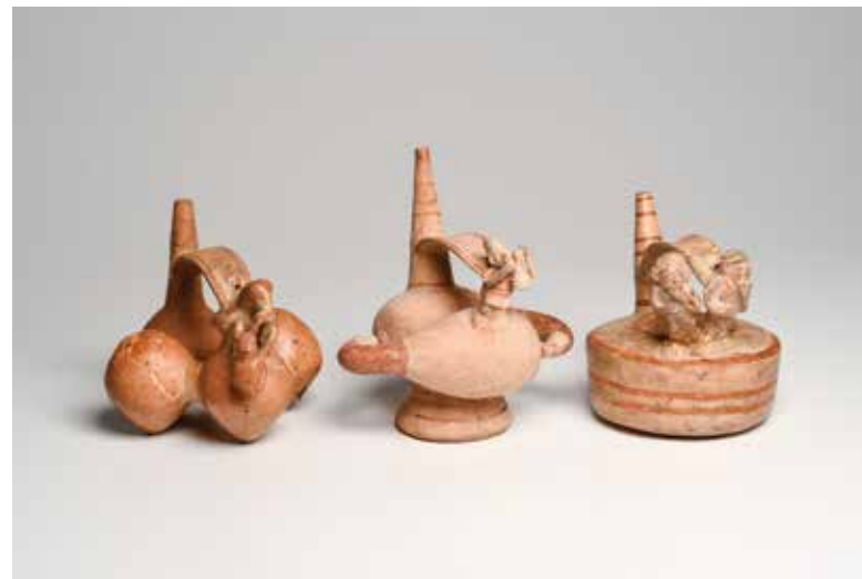
721. Chancay Spouted Vessels (3) Chancay. Ca. 1000-1250 A.D. 5-3/4" to 7-5/8"H. Private collection of a NJ physician, acquired from Vito Giallo Antiques, NYC., acquired 1980s-1990s. Est. $600-$900 Closing: Wednesday, March 4th, 4:42 P.M.